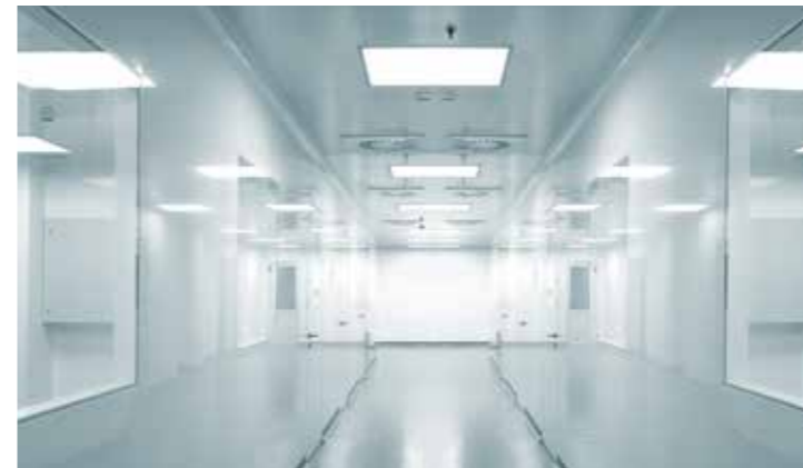
Bed configurations and the placement of adaptable,