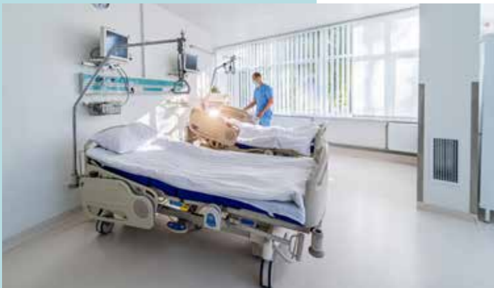
Housing 88 beds in a suitable layout for delivering highly efficient healthcare support,

As a natural result of the importance it places on sustainability and its environmental sensitivity the company achieved its ISO 14001 environmental management system certification in 2012. The Assan Panel Quality approach has also been documented beyond our borders with Gost-Russia and Ukr - Sepro / Ukraine quality certificates. Assan Panel has also earned FM Global and LPCB certificates in fire, wind and impact endurance for its sandwich panels. Also the company was the first and only company to earn both the UL Greenguard and Greenguard Gold certificates with environmentally friendly products that do not compromise the indoor air mass. Assan Panel, the most preferred brand in the sandwich panel market with the objective of providing added value to Turkey, exports to 76 countries.