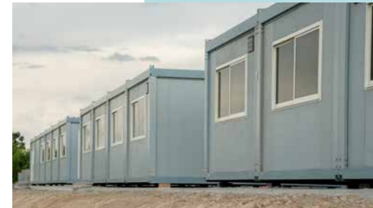
Larger rapid build constructions that are low cost to run.